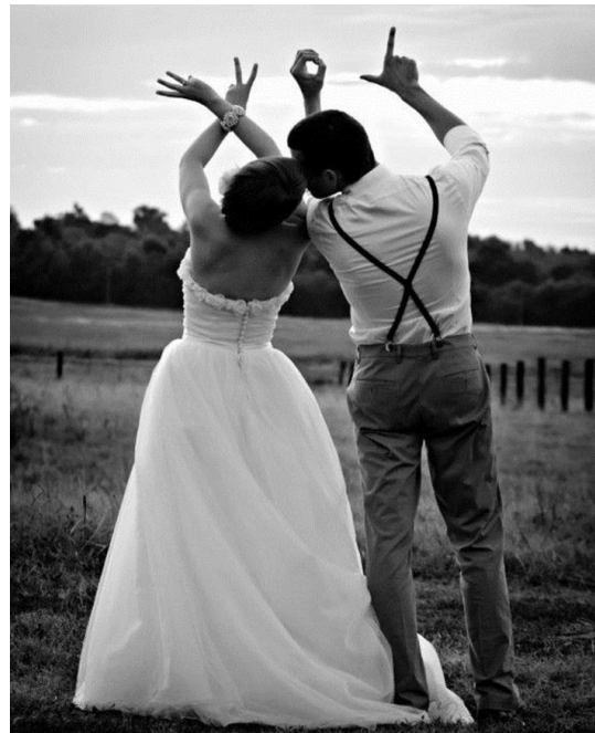
They don't have the right to get married with a white person

White and black people can't eat together and they can't do many other things