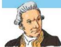
New South Wales (Captain Cook) 1770