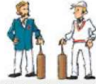
first cricket match Aus v Eng 1887