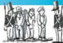
last prisoners 1868