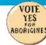
right to vote 1967