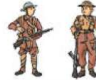
Australian troops WW1 & WW2