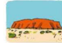
Uluru → Aboriginals 1985