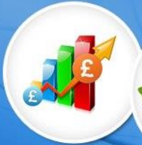
Pay Per Click