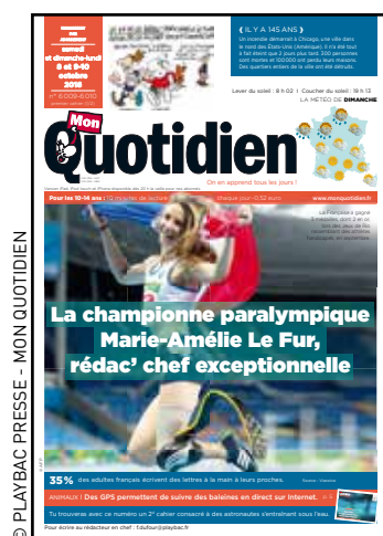
© PLAYBAC PRESSE - MON QUOTIDIEN