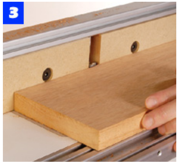
Shim the outfeed fence of a router table so it's aligned with the bit, and use your table to joint the stock edges.