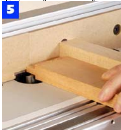
Cut all of the tenons with a router table and miter gauge. Use scrap stock behind

Lay out and cut the joining plate slots at the miter joints between the top and sides, and the joints between the bottom and sides. Then, rout the grooves in the side and top panels that house the case back. Rip and crosscut frame parts for the case back and drop-front lid to specified dimensions. At the same time, cut the rail stock for the desk base to finished size.