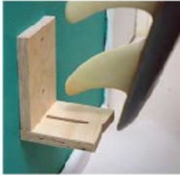
Fin-shaped brace template