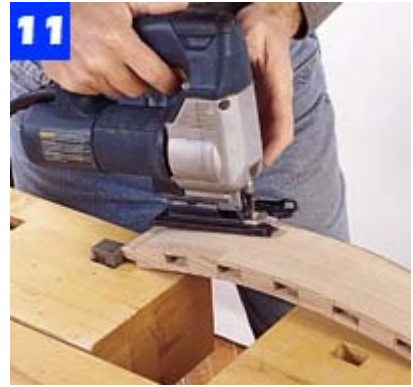
Use a template to lay out the arched profile of the upper back rail. Then, cut to the line with a sabre saw and smooth.

Mark the shoulders on the top and bottom edges of the curved back rails and use a small backsaw to make the cuts (Photo 12). First, make the cuts into the endgrain of the tenon. Then finish the shoulder by cutting across the grain.