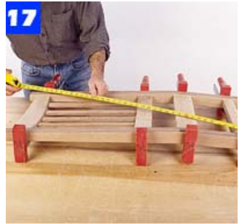
Join the back rail and slats to the legs. Apply the glue sparingly, clamp, and check that the diagonals are equal.

Once the glue has set on the subassemblies, complete the chair frame by joining the side rails to the back-leg assembly. Spread glue on the mating surfaces and position the joints. Apply clamps to pull the joints tight. Set the chair upright on a flat worktable to be sure that all four legs sit evenly (Photo 18). Adjust the clamps and joints, if necessary, until any rocking is eliminated.