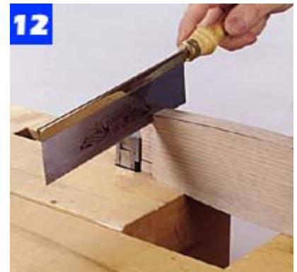
Cut the shoulders of the curved back rail tenons with a small backsaw. First cut in from the end, then across the grain.

Spread glue on the tenons of the back rails and in the matching mortises in the back legs. Join the rails to the legs, clamp and compare opposite diagonal measurements (Photo 17).