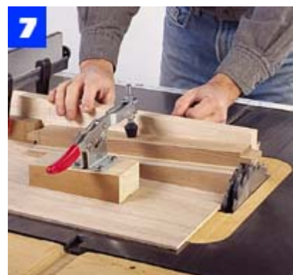
When cutting the opposite tenon faces on the rails, reverse the ramp on the jig and readjust the dado blade height.