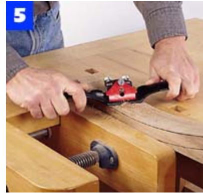
Use a spokeshave to smooth the inside curve of the back rail, and then cut and smooth the outer curve.

Cut one surface of each tenon with the ramp angled down toward the dado blade (Photo 6). Then, secure the ramp in the opposite direction and readjust the blade height for the opposite side of each tenon (Photo 7). If you're using the holddown clamp, you'll need to remount it. Then, use the miter gauge without the jig to make the angled cuts for the top and bottom shoulders of the side rails (Photo 8). Cut strips for the side and back slats. Crosscut the slats to finished length, and set them aside.