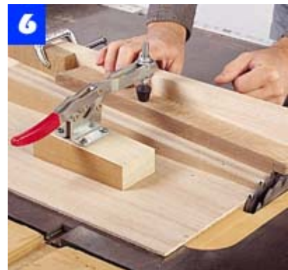
To cut the angled tenons on the side rails, support the stock in a table saw jig that holds the work at a 4° angle.

Install a 5/16-in.-dia. bit in the drill press and bore slightly overlapping holes to remove most of the waste from the mortises in both the curved and straight rails (Photo 9). Then, use a sharp chisel to pare the walls and square the ends of the mortises (Photo 10). Test a slat in each mortise--the fit should be snug. Make another template for the arched shape of the top back rail and use the template to trace the shape onto the workpiece. Use a sabre saw to cut the profile (Photo 11).