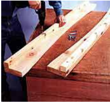
Step E: Add Slats to the Aprons

5. Trace the profile of the arch onto the other apron; make and sand the cut.