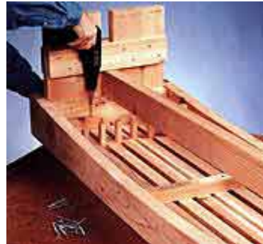
Step F: Install the Aprons & Slats

Cut the slats (F) to length. Attach a slat to the top, inside edge of each apron, using glue and deck screws.