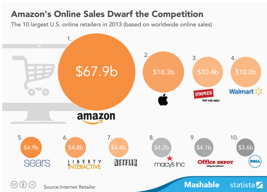
Figure 1. Total revenue of Amazon in 2013 compared with the nine closest competitors (Source: Internet retailer and Statista.com)

Amazon.com aired in the summer of 1995, and since then Amazon has managed to turn its business from being a digital bookstore into being an Internet-based product giant. Today, it is almost impossible to find any items that Amazon does not sell. This and more, has brought an extraordinary growth and in 2013 Amazon was believed to be bigger than the closest nine competitors combined.