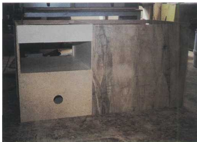
3 The three backs in the desk unit shown in place. Notice the wire chase hole for the printer drawer.

Before assembling, pre-sand the visible sides of the bulkheads and