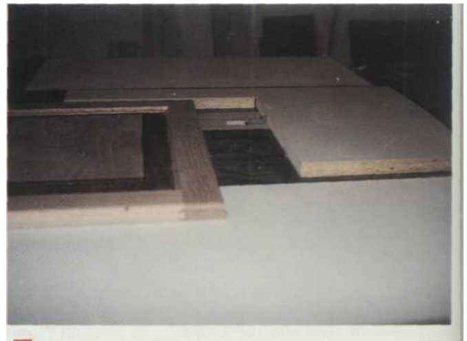
7 The edge view of the door shows the through tenon and groove used to assemble the stiles and rails.