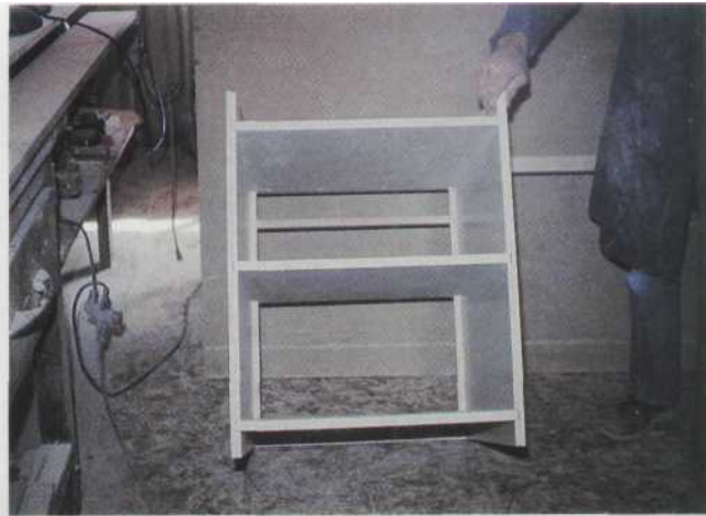
2 The assembled drawer section with shelves in place. The face frame has already been glued on.

hard drive unit and printer. If you find the spaces inappropriate for your system, adjust the spacing accordingly.