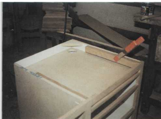
4 The pull out board is shown in place with a top guide (V) being held in place with squeeze clamps.

Screw the stop piece (W) to the top of the pull out board at the desired length. The pull out board