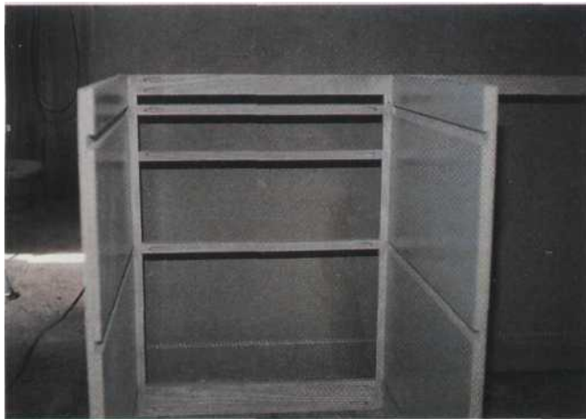
1 Mirrored dados in the drawer bulkheads are ready to receive the drawer shelves.