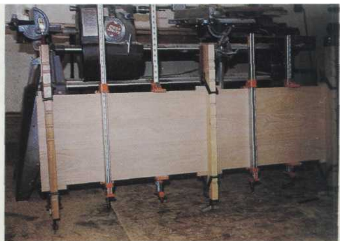
5 Alternating clamps help keep the glued-up top level while drying.