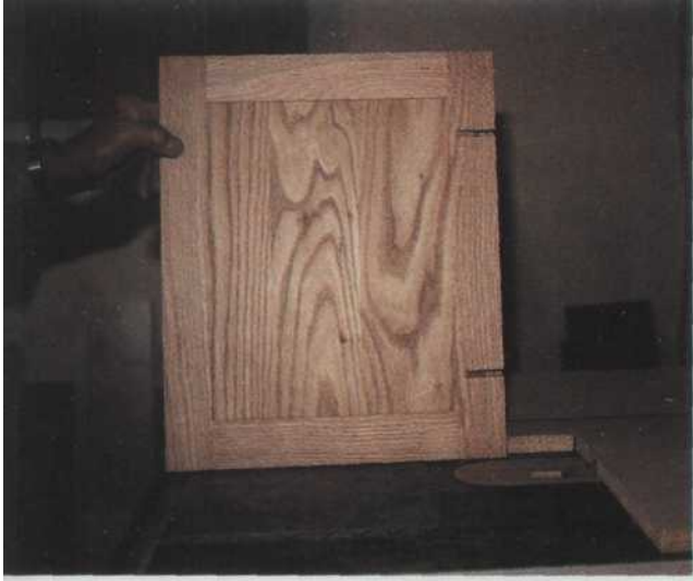
8 The back of the door shows the dadoes cut to receive the hinges.

The stiles and rails for the door are made on the shaper using a standard 1/4" tongue and groove ( photo 7 ). Although some woodworkers find a 3/8" or 1/2" tongue and groove make the door stronger, the 1/4" is sufficient. Use the sizes given in the Materials List to cut out and assemble the doors.