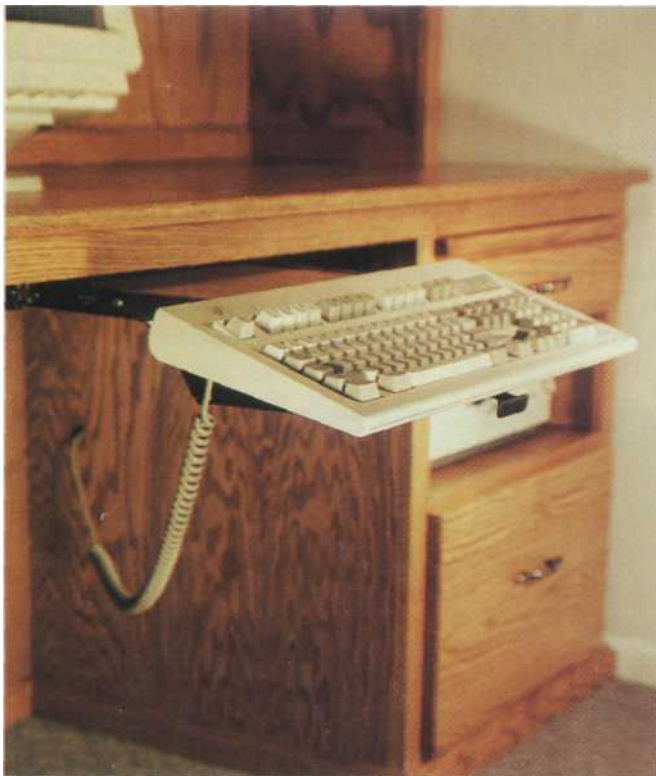
6 The keyboard retracts under the top to allow for a cleaner desk top. Notice the cable running into the side of the drawer section.

The doors depicted on this hutch are fashioned in the popular raised panel mode. In case of expansion, it may be beneficial for you to stain the interior of the panel prior to assembling rather than after, since the stain may not cover the unexposed areas.