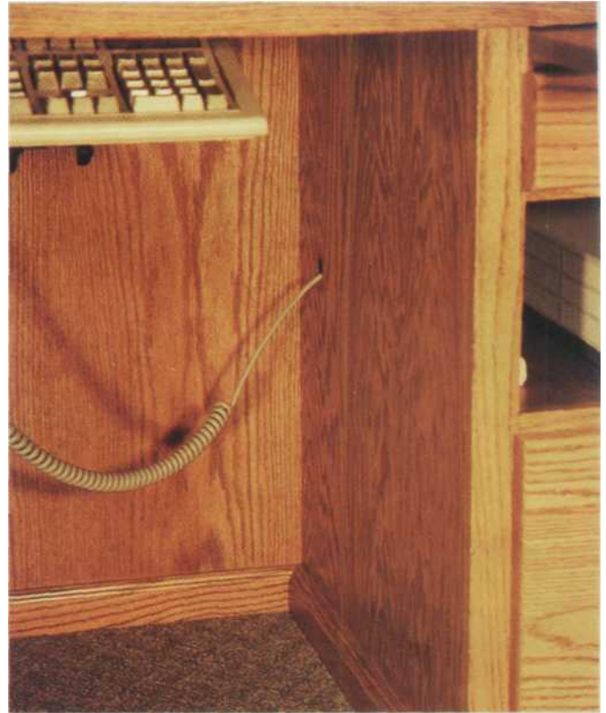
9 This detailed photo shows the hole cut in the drawer section's left bulkhead for the keyboard wire.

Now you're almost finished, with the exception of a couple modifica-