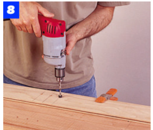
Make a template of the shelf-pin hole locations. Then, use the template to position the holes in the case sides.