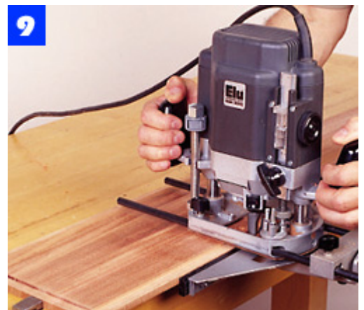
Cut back panels to size from 1/2-in.-thick stock and use a router to shape the rabbet around the panel edges.