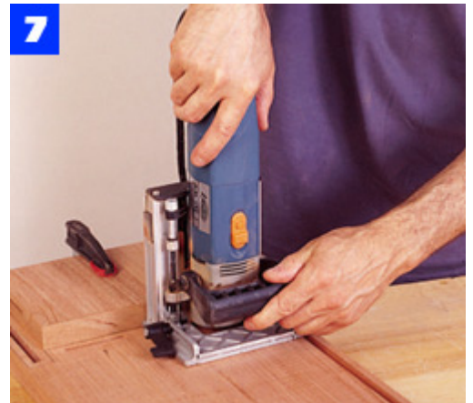
After cutting slots in shelf ends, cut matching slots in case sides. A block clamped to the side locates the joiner.

Bore and countersink screwholes in the case feet. Spread a bit of glue on each foot and fasten them to the bottom ends of the sides with 1-1/2-in. No. 8 screws (Photo 11).