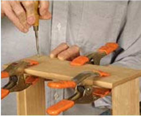
The top is screwed straight into the sides, then plugged and trimmed flush.