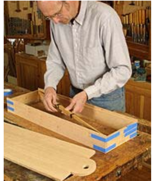
The false top and false bottom are simply butt-joined and glued to the sides. The actual top and bottom will reinforce this joint. Before the glue sets, check to make sure the case is level and square.

I prefer to use a false bottom and top, which not only make glue-up easier but also act as a doorstop in front and create rabbets to house the back. Glue the false top and bottom to the sides using butt joints. Once the glue dries, center the actual top and bottom on the case and screw them into the sides.