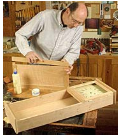
Before applying glue, carefully dry-fit the doors and see that they fit the case.

As far as a finish goes, I am partial to Tried & True Varnish Oil. It leaves a silky, penetrating finish that I prefer. More accurate for this clock would be a shellac finish, which was used on the original.