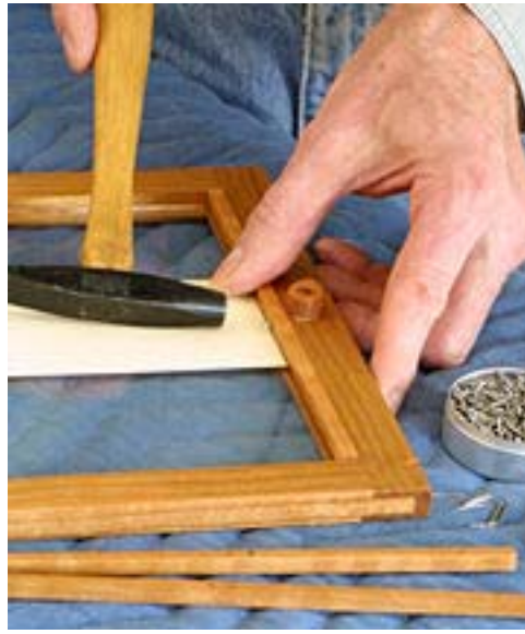
After the glass is set into the rabbet, small glass supports are nailed into place.