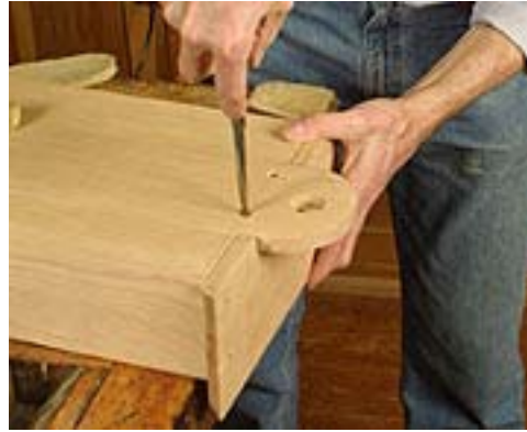
The back is screwed only near the center. The edges are then nailed into place, allowing for seasonal movement.

The clock back simply butts up against the false top and bottom and is screwed into place from behind. However, this is where wood movement comes into play. The back is about 9-1/2 in. wide, which means that a piece of flatsawn cherry will move about 5/32 in. (from 6% moisture content in winter to 13% moisture content in summer). If you can locate or glue up a quartersawn back, the amount of movement is cut in half, to 5/64 in. So, if you're building in the summer, when the back has reached a moisture content of near 12% or 13%, the back can be fitted tightly. In the winter, when the moisture content of the back is closer to 6%, a gap of just under 3/64 in. is required on each side. Also, leave a small gap where the half-round hanger protrudes through the top.