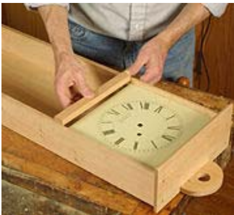
The horizontal divider is sized to act as a doorstop for both doors. It is set into the stopped rabbet that holds the clock face.

Another change I make is to increase the size of the hanger hole, from 1/2 in. to 1-1/8 in., to allow the clock to be hung on a Shaker peg. The back is merely nailed into place, with a dab of glue in the center to ensure that wood movement is equal in both directions.