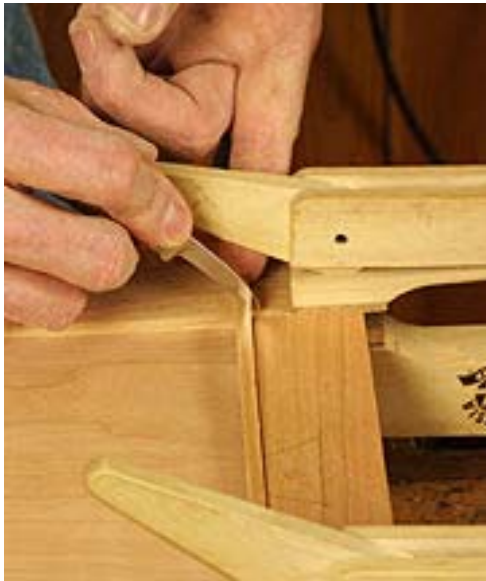
The quarter-round molding is shaped on the router, then mitered to fit the door. Becksvoort simply glues the molding to the rails and the stiles.

The doors are relatively straightforward, mortised and tenoned at each corner. Cut haunched mortise-and-tenon joints on center, and make sure to offset the glass and panel grooves to allow room for the thumbnail profile along the fronts. The frames are 1/2 in. thick, and the bottom panel is only 3/16 in. thick. The 3/16-in. quarter-round moldings are added after the panel is in place. On the top door, add the quarter-round moldings to hold the glass on the outside, and add 3/16-in. glass supports, nailed from the inside, to hold the back of the glass.