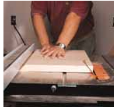
Disappearing Miter Trick • Unless your rip fence is tight to the saw table, the miter will have a tendency to slide under the fence during the second cut (on right tilt saws). Recheck your measurements to accommodate this, or add a tight-fitting auxiliary fence to the standard rip fence.