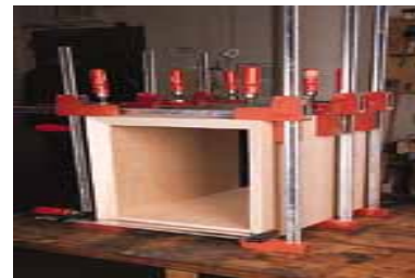
A Little to the Left • Enough clamps and careful adjustment during glue-up will ensure tight miters and an evenly spaced opening from top to bottom.