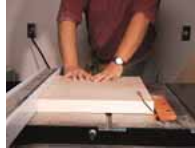
Center-cut Slab • The first miter cut on the center slab (on a right-tilt saw) will balance the fall-off piece on the blade. Be aware of possible kickback of the scrap piece.

edges, and too much pressure will force the front edge caul to slide.