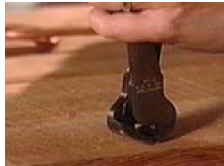
Cutting off the end of the nail using the bull-nose nippers