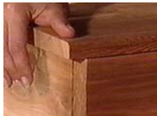
Detail of cabinet assembly with door overhang