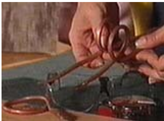
Copper tubing door pulls

Center the backing boards on the cabinet frame, and then nail them in place once they're lined up nicely.