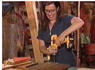
Drilling the Peg Holes