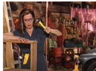
Hammering in the last copper nail