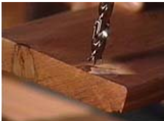
Detail of a Brad Point Drill Bit

Lay the two sidepieces out on your work surface. Measure and mark matching pairs of holes on the two 17" cabinet sides. These holes will hold the shelf-support pins.