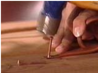
Using copper nails to attach the door pulls

Now drill one small hole in each end of the handle, so you can affix it to the cabinet doors. (Before you drill the hole, it helps to make a dimple in the copper using a hammer and nail; the dimple will prevent the drill bit from skating around on the hard metal.)