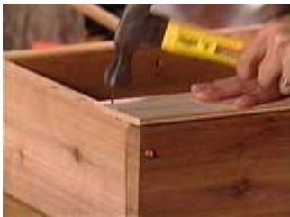
Attaching the Bead Board backing

Center the backing boards on the cabinet frame, and then nail them in place once they're lined up nicely.