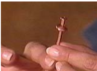
Copper nail with rove

Clamp the boards in place or use a non-skid vinyl mat, and then drill the holes the right diameter and depth to fit your shelf-support pins.