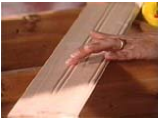
Bead Board example

Pre-drill and then nail each corner of the cabinet frame together, using copper nails. Use a speed square to make sure the cabinet is square. If not, reef on it to pull it into alignment.