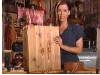
The finished cabinet

Now attach the hinged doors to the cabinet. Use a pile of books to hold the door level while screwing on the hinges, and try to create a slight gap between the inside edges of the doors so they don't bind on each other. If they do bind, plane the inside edges using a hand plane, or coarse sandpaper.