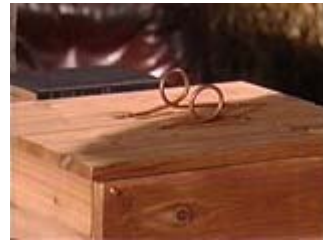
The copper door pulls attached

Attach the handles to the cabinet doors using copper nails. The nails will be too long, so snip the sharp ends off flush with the inside surface of the cabinet door, using bull-nose nippers.