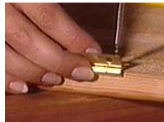
Attaching the hinge to the door

Attach the brass hinges to the cabinet doors, using an ice pick or awl to mark a starter hole for each screw. Use a hand screwdriver rather than a power drill to drive the screws, because brass is so soft it will strip if you use a power tool on the delicate heads.