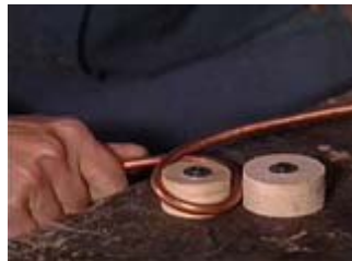
Making the door pulls using a round jig

Make cool handles out of flexible copper by bending the tubing around a cylindrical object (even a jar works fine). Then, using a ballpeen hammer, or even just a regular hammer, pound the tube-ends flat on a hard surface (the flat top of a vise works well if you don't happen to have an