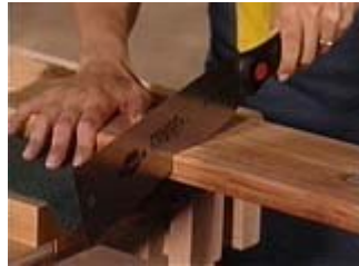
Cutting Cedar with Japanese saw