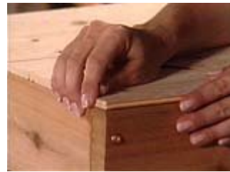
Fitting the Bead Board backing on the frame