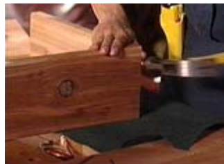
Hammering in the first copper nail