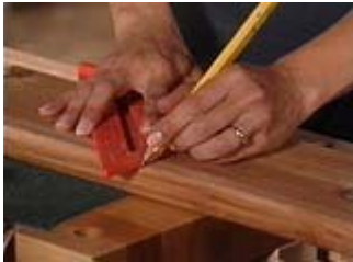
Marking Cedar with speed square