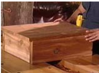
Cabinet assembly with door overhang and side configuration

Attach the handles to the cabinet doors using copper nails. The nails will be too long, so snip the sharp ends off flush with the inside surface of the cabinet door, using bull-nose nippers.