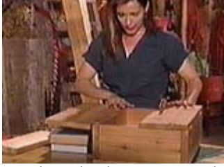
Attaching the doors using a pile of books for support