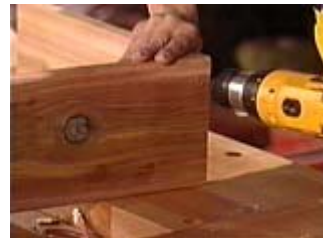
Drilling for the Copper Nails

Clamp the boards in place or use a non-skid vinyl mat, and then drill the holes the right diameter and depth to fit your shelf-support pins.