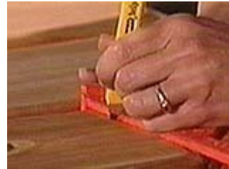
Marking the sides for drilling the peg holes

Lay the two sidepieces out on your work surface. Measure and mark matching pairs of holes on the two 17" cabinet sides. These holes will hold the shelf-support pins.