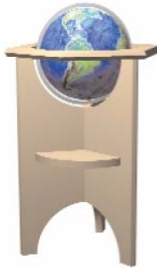
...or a globe stand in the style of Frank Lloyd Wright...