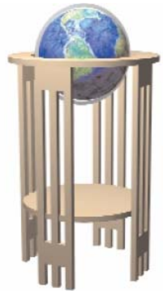
...or even in the style of a Gustav Stickley end table.