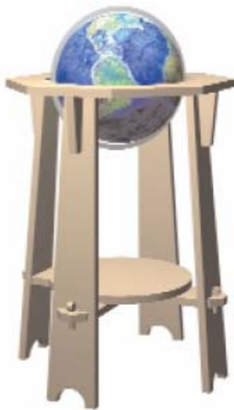
You might prefer a tapered-leg taboret with wedged tenons...