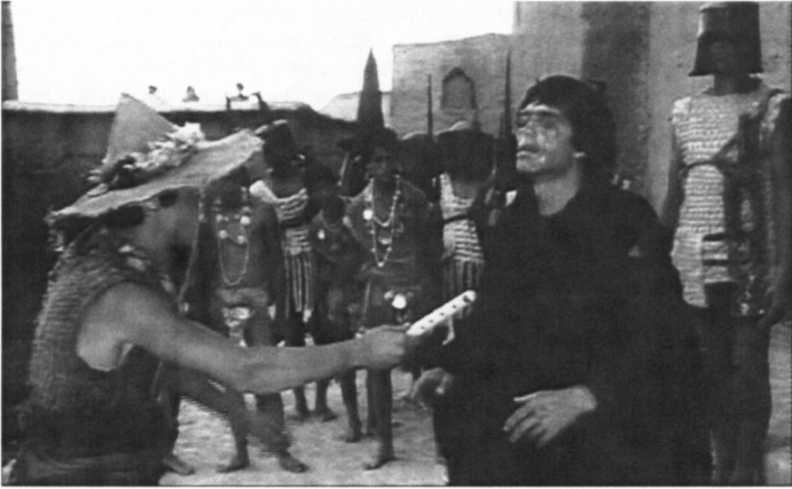
Fig. 2. Oedipus now blind receives the flute from Anghelos.

tell the future, since he predicts to Polynices how he and his brother will die. Oedipus can also advise (OC 1518 ἐγὼ διδάξω, 1539: ἐκδιδασκόμενος) Theseus about important issues that will be beneficial for Athens.