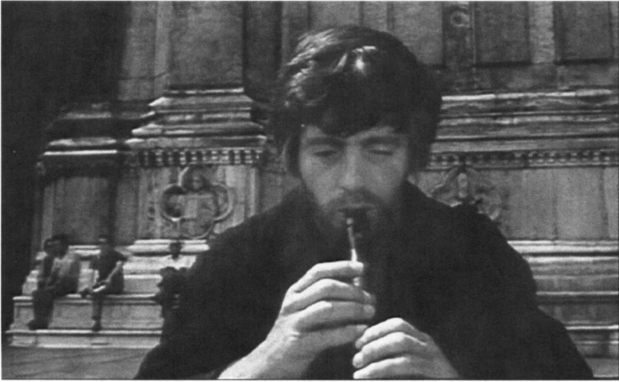
Fig. 3. Blind Oedipus playing the recorder on the stairs of San Petronio cathedral in Bologna.

tuals and poets. This is why the blind Oedipus sits down on the stairs of San Petronio cathedral – a masterpiece of Italian architecture – and like the old Tiresias in the second movement of the film starts to play his instrument, now a recorder. The people, however, only give a few distracted and uninterested glances at the blind player. In this beautiful urban landscape, the middle class displays with pride its new wealth and self-satisfaction, but they do not listen to blind Oedipus' tune, because – Pasolini seems to suggest – they 'do not want to know', just like young Oedipus in the second movement of the film.