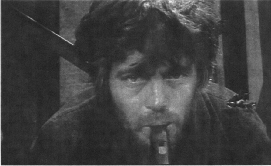
Fig. 4. Blind Oedipus playing a Russian folk song outside the factory.

Here Oedipus, alone, plays a Russian folk song, one of the songs that Italian soldiers learned in Russia during WWII and then used as a revolutionary song in the Italian Resistance (Fig. 4). 37 It was a very popular tune about freedom and revolution that would remind any listener of the hope for social justice and a better future; exploited workers would be especially sensitive to such ideals. But Oedipus faces another disappointment. Workers pour out from their workplaces, but none of them pays any attention to the tune that he plays for them as they head home in a hurry. Just like the middle class, proletarians are confined within the walls of their 'bourgeois' lives disillusioned and without any further hope; Oedipus and Angelo depart from the lonely industrial landscape (Fig. 5).