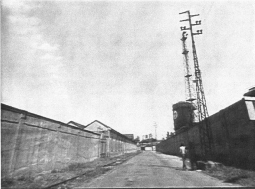
Fig. 5. Blind Oedipus and Angelo leaving the factory area in solitude.

Pasolini's sad conclusion is that in the economically thriving Italy of the 1960s no one bothers to listen to intellectuals and poets. Not the middle class, lost in their pursuit of empty materialism and deprived of any individuality, and not even the peasants and proletarians who envy the wealth of the middle class and try to emulate their behavior. The economic boom seems to have erased any difference between the two in its destruction of the old world of values: