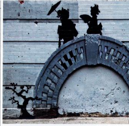
▲ Banksy's painting on the Tabachniks' building

By Cara Tabachnick | 10/18/2013 at 3:04 PM