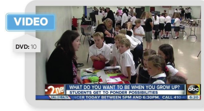
↑ ABC 2 News, Career Day (2012)

2 a. Look at the screenshot. Make hypotheses about what a Career Day is and what the students are going to do during this day.