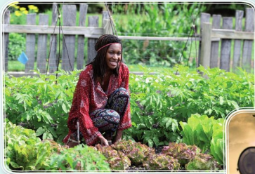
← This is a WWOOFer who is working on a farm in Nigeria. Incredible, right?