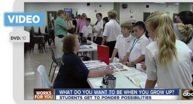
↑ ABC 2 News, Career Day (2012)