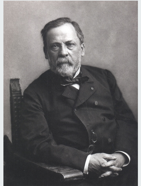
Louis Pasteur 1877