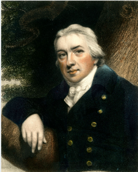
Edward Jenner 1796