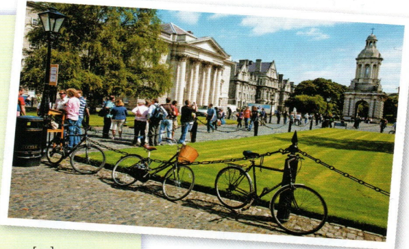
▲ Trinity College in Dublin