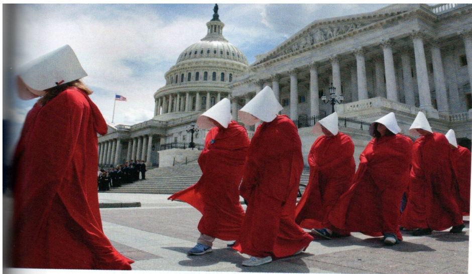
A picture of women dressed up as handmaids demonstrating against budget cuts to Planned Parenthood (an organization that provides sexual health care) in Washington D.C., 2017

American democracy has never felt so challenged [Atwood says]. "The real reason people expect so much of America in modern times is that it set out to be a utopia. That didn't last very long. Nathaniel Hawthorne nailed it when he said the first thing they did when they got to America was build a scaffold and a prison.