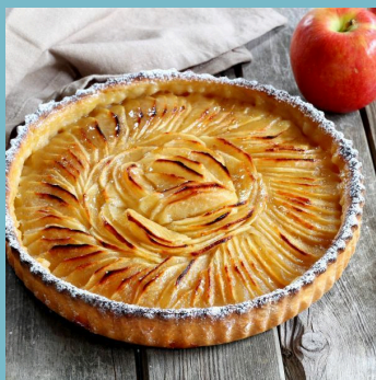
Tarte aux pommes, by Neverly, p3