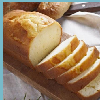
Gâteau au yaourt, by the class, p12