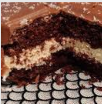
Gâteau Kinder, by Océane and Syllio, p11