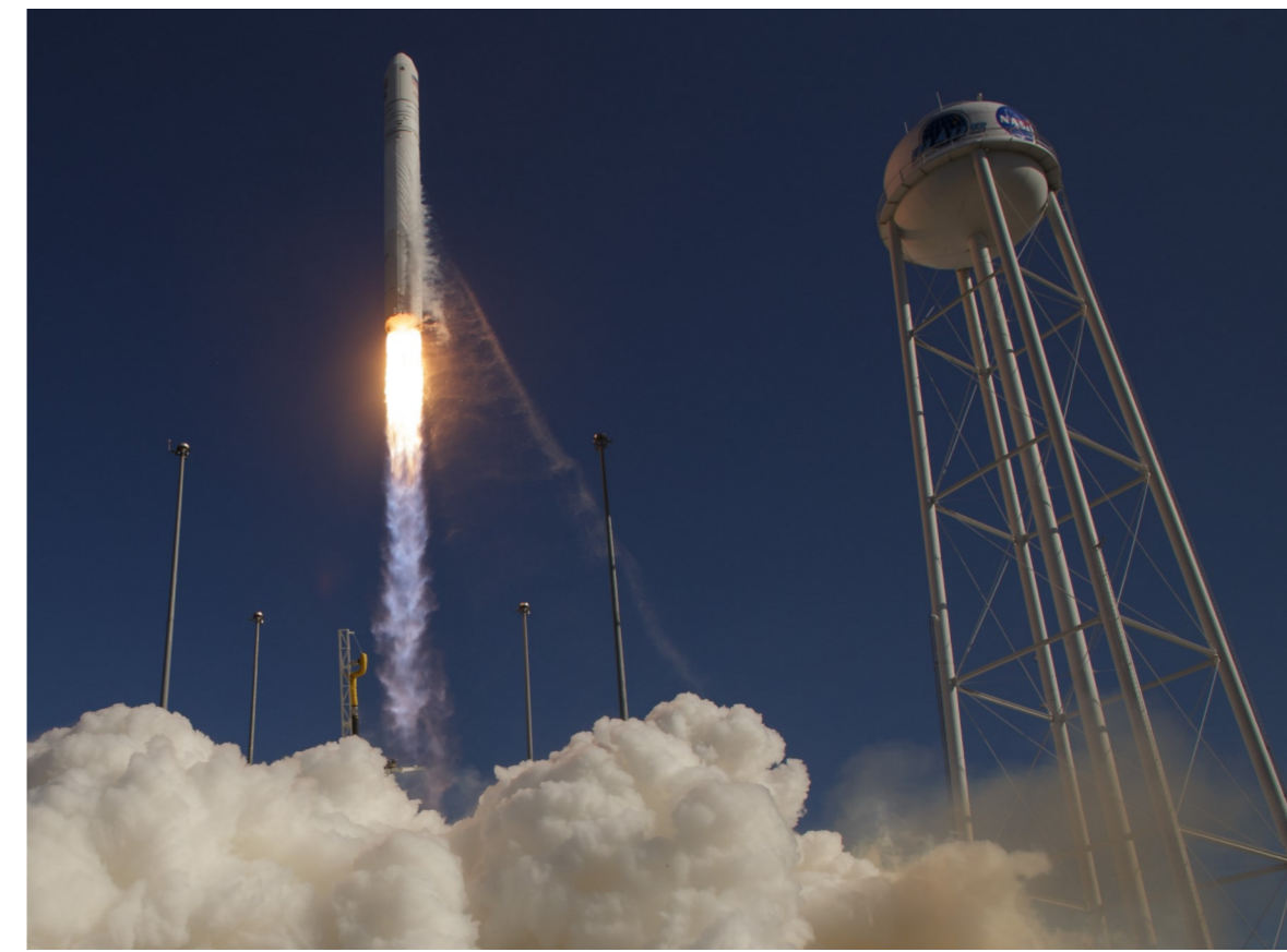
Satellite Applications Catapult launched their IOD-1 GEMS Satellite in 2019

The Satellite Applications Catapult is one of a network of UK technology and innovation companies which aim to drive economic growth through the commercialisation of research. Our aim is to support UK industry by accelerating the growth of satellite applications and to contribute to capturing a 10% share of the global space market predicted by 2030.