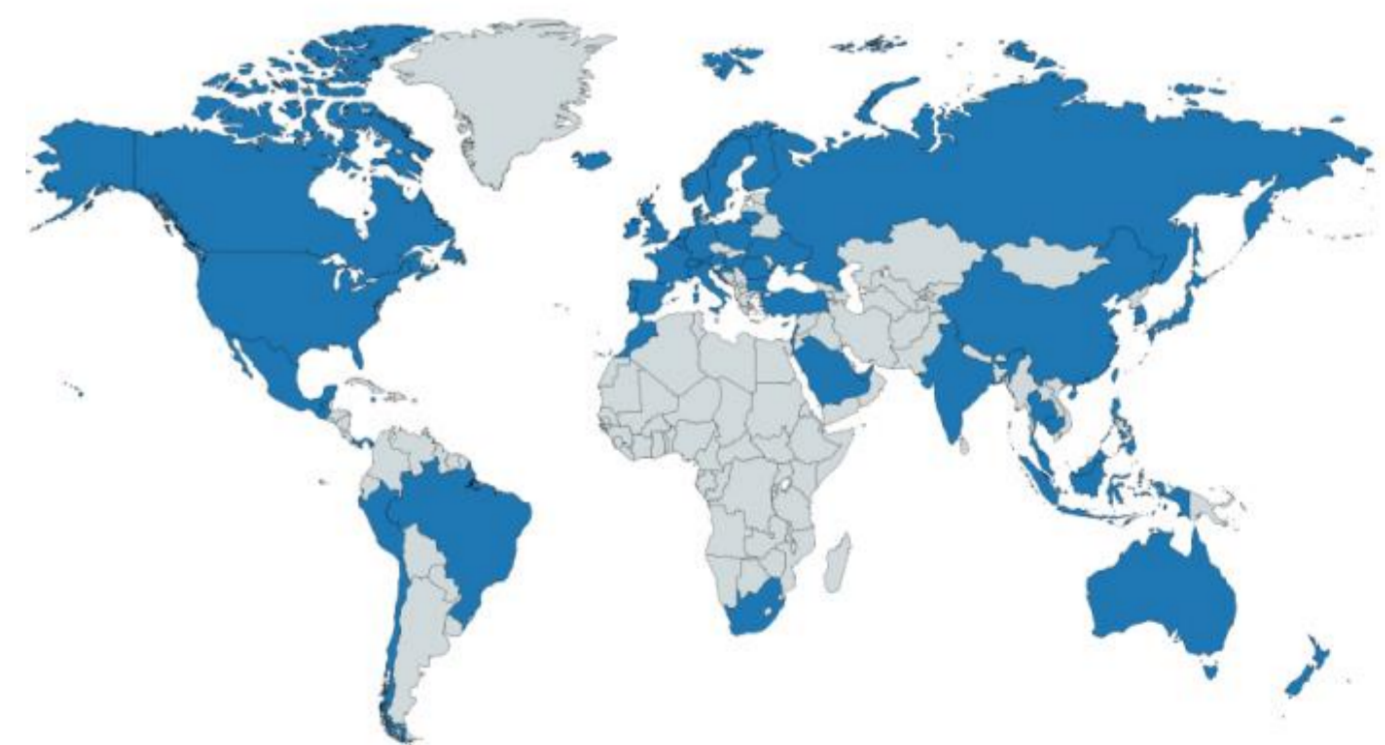
Figure 3: Highlighted in blue are markets which sell Dyson products

Global marketing campaigns created at the HQ were reviewed for optimisation based on local market requirements. Bespoke local projects were supported to ensure they were produced on time and to budget.