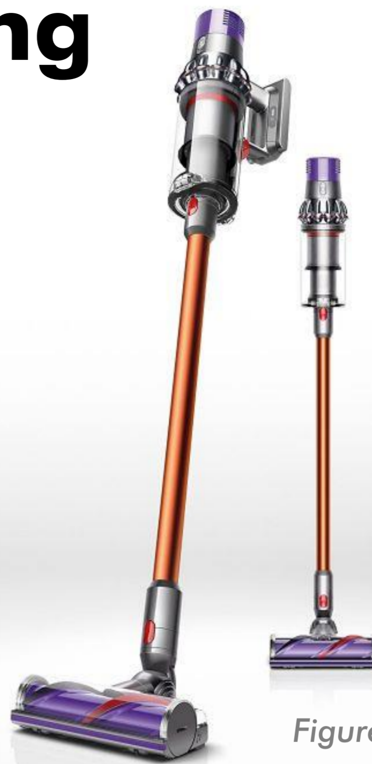
Figure 1: Dyson Cyclone V10™ vacuums