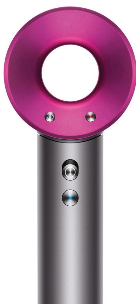
Figure 4: Dyson Supersonic™ hair dryer