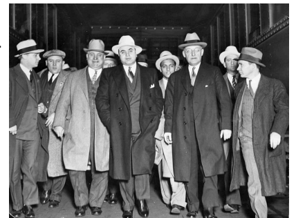
Al Capone's gang