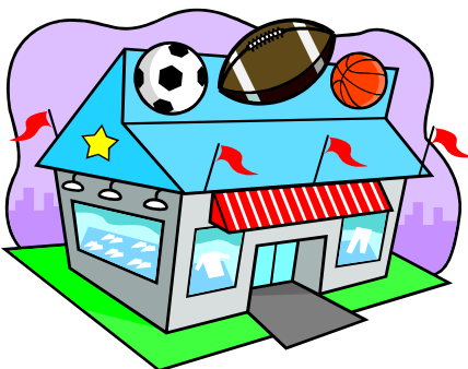
the sports store