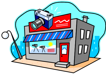
the photo shop