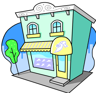
a shoe store