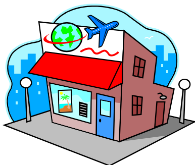
a travel agent