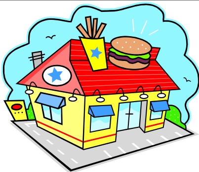
a fast-food restaurant