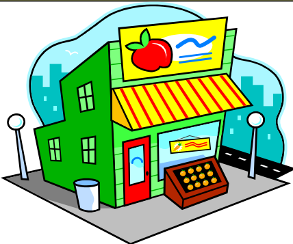
the corner store