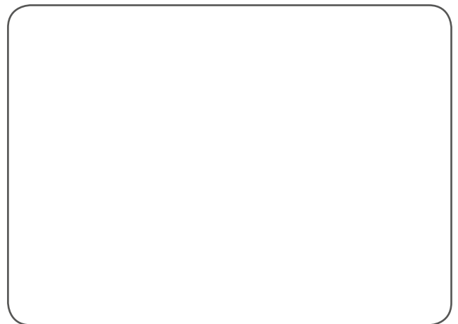
a small grey kitten