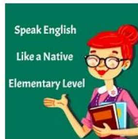
Apprendre à parler anglais - Conversations Audios