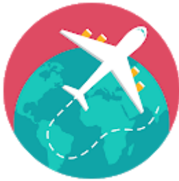
Phrases de voyage