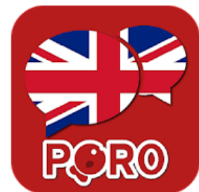
Apprendre L'Anglais - Écouter et Parler