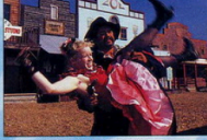
GO WILD IN THE WEST

This ride is an amazing twisting turning roller-coaster created for cowboys and cowgirls.