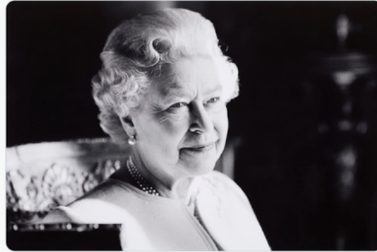
7:30 PM · 8 sept. 2022