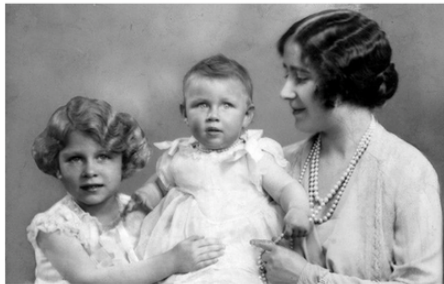
1. Queen Elizabeth II was born at 2.40am on 21 April 1926