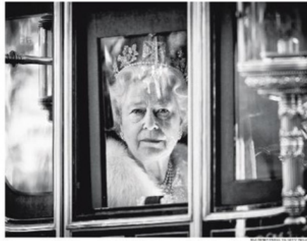
A Country in Turmoil Enters a Period of Mourning and Transition

Elizabeth II, Whose 7-Decade Reign Linked Generations, Dies at 96