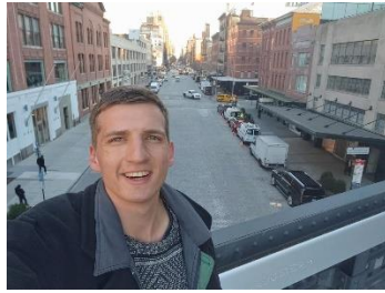
Me on the High Line in Manhattan.

I am a journalist from South Africa who worked in New York City for two weeks in December.