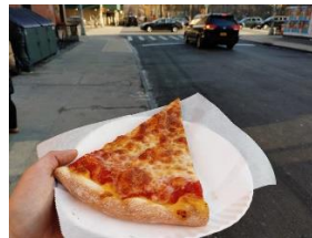
That's a big pizza. The pizzas are too big!

One pizza slice was the size of half an entire pizza pie in South Africa. From oversized chips portions with burgers to the suffocating pizza slices and ginormous Frappuccinos, everything was huge.