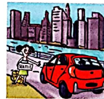
get a ride