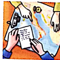
work out / plan a trip