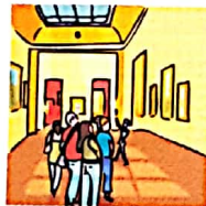
visit / hit a spot