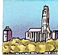
church / cathedral /kəθi:dɪrəl/