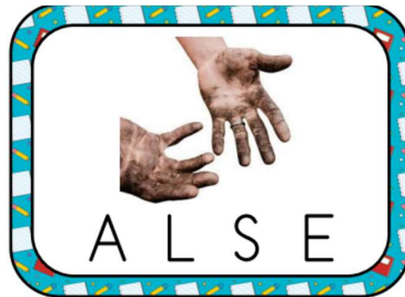
Fig. 44.1. A. L. S. E.