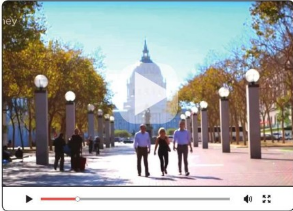
◆ Gentrification in San Francisco, CNN, 2016

1 Use the following words to explain what Cleve Jones means by “economic apartheid”.