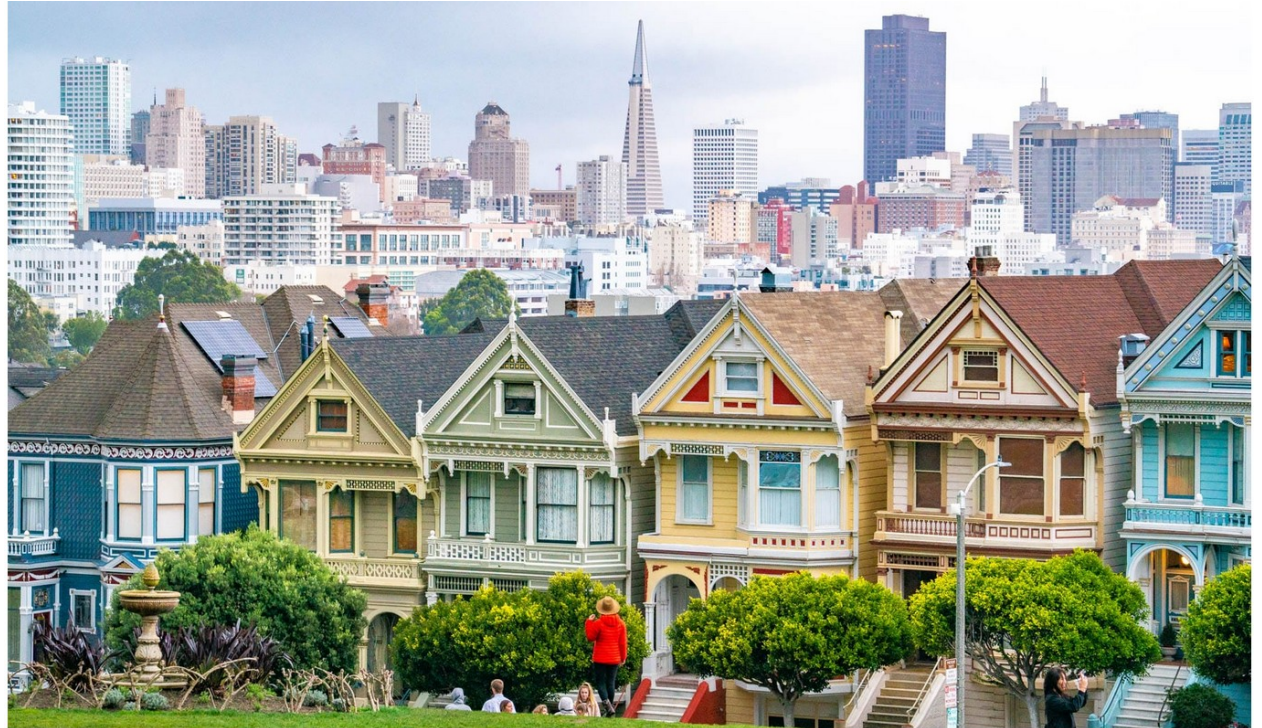
The painted ladies (Victorian houses)