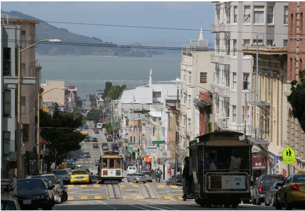
Nob Hill (wealthy neighbourhood)