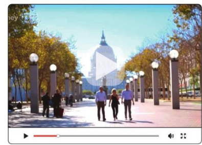
↳ Gentrification in San Francisco, CNN, 2016

How does gentrification change US neighbour hoods?