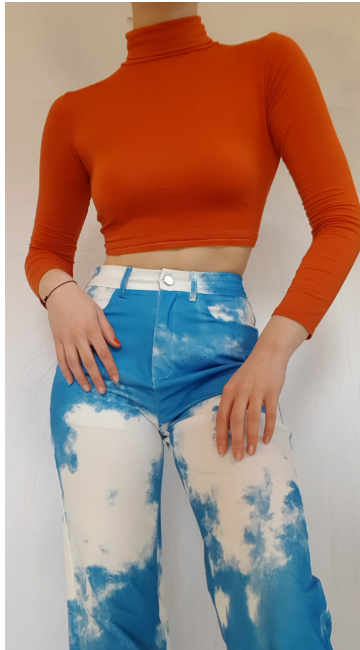
Inspiration Paloma Wool