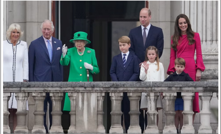
Last Day of the Jubilee, Last Balcony 2022