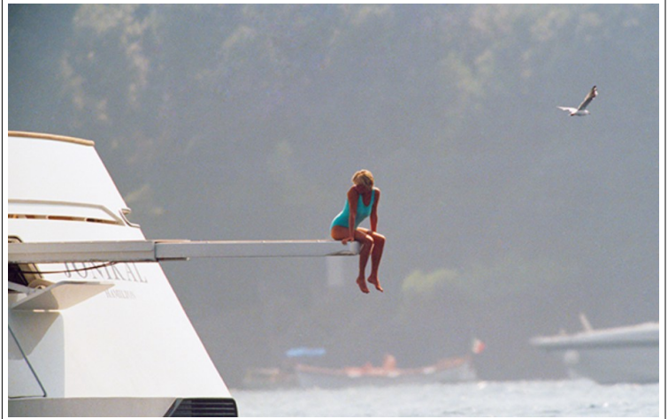
Diana last's holiday with Mohamed Al Fayed, 1997