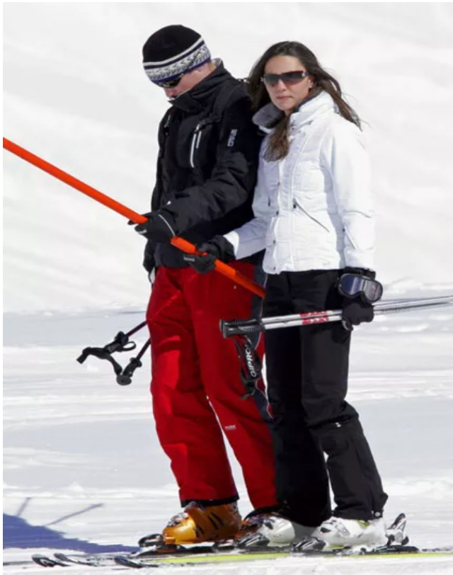
William and Kate, Ski Holidays, 2008