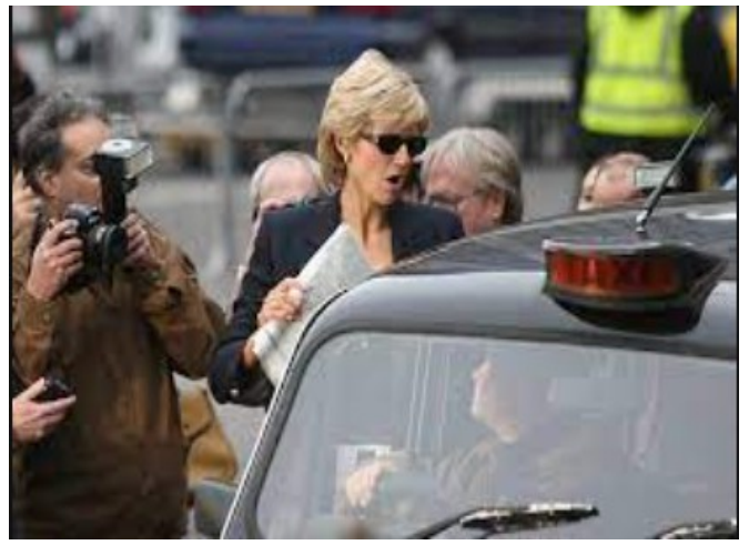
Princess Diana, 1993