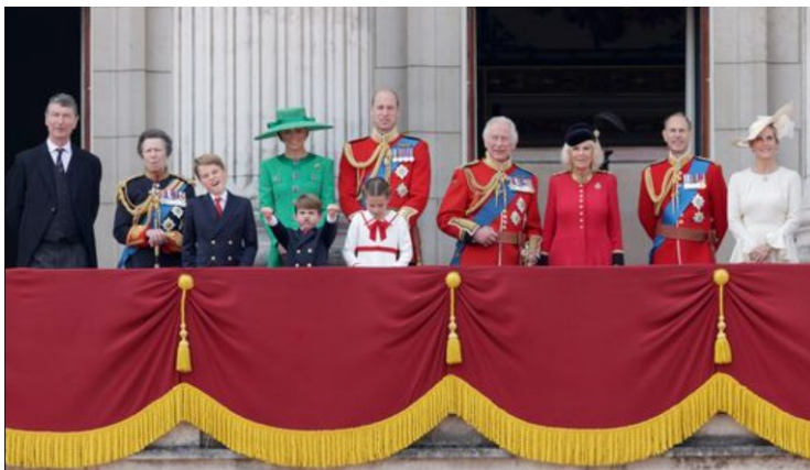
Trooping the Colors, balcony picture, 2023