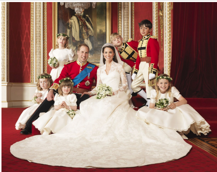
Wedding portrait, William and Kate, 2010