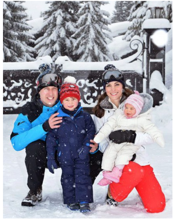
Ski Holidays, 2016