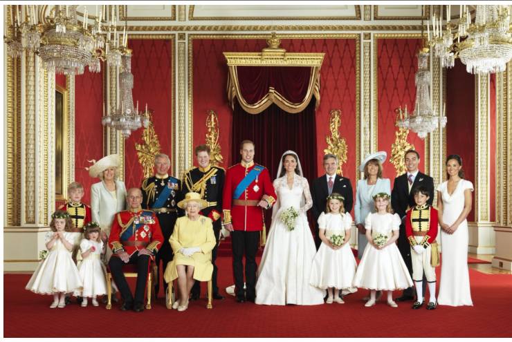
Wedding day, William and Kate, 2010