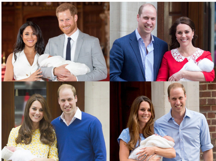
Introducing the Royal Babies Prince Arche May 2019, Prince Louis April 2023, Princesse Charlotte May 2015, Prince George July 2013