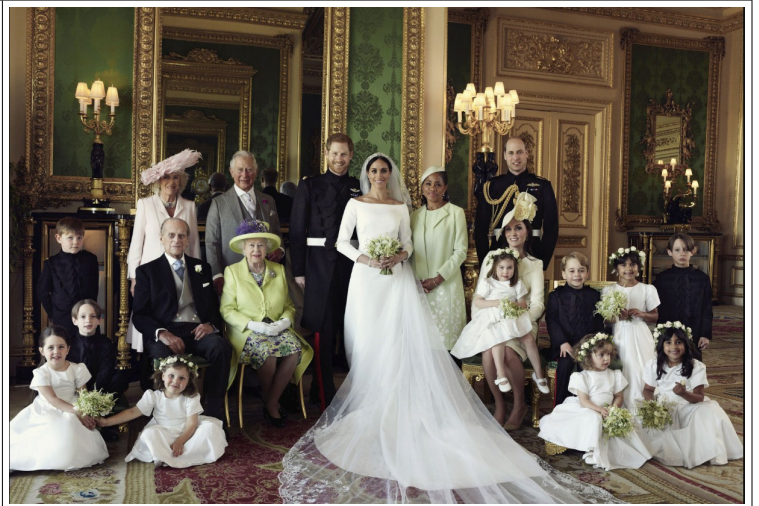
Wedding day, Harry and Meghan, 2018