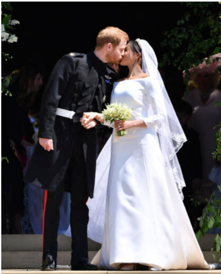
Meghan and Harry wedding Kiss, 2018