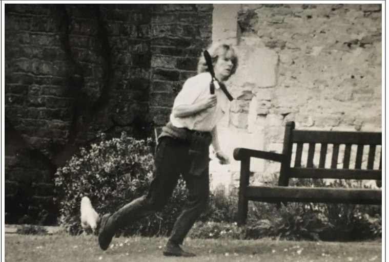
Camilla Parker Bowles in her garden, 1995