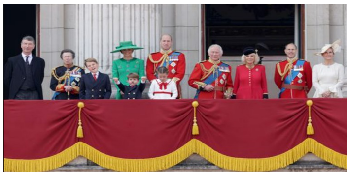
Trooping the colors, balcony, 2023