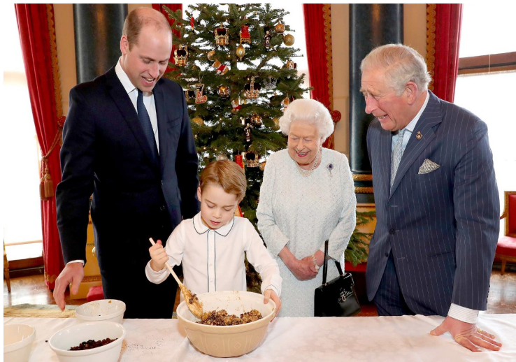
Christmas card, 2019