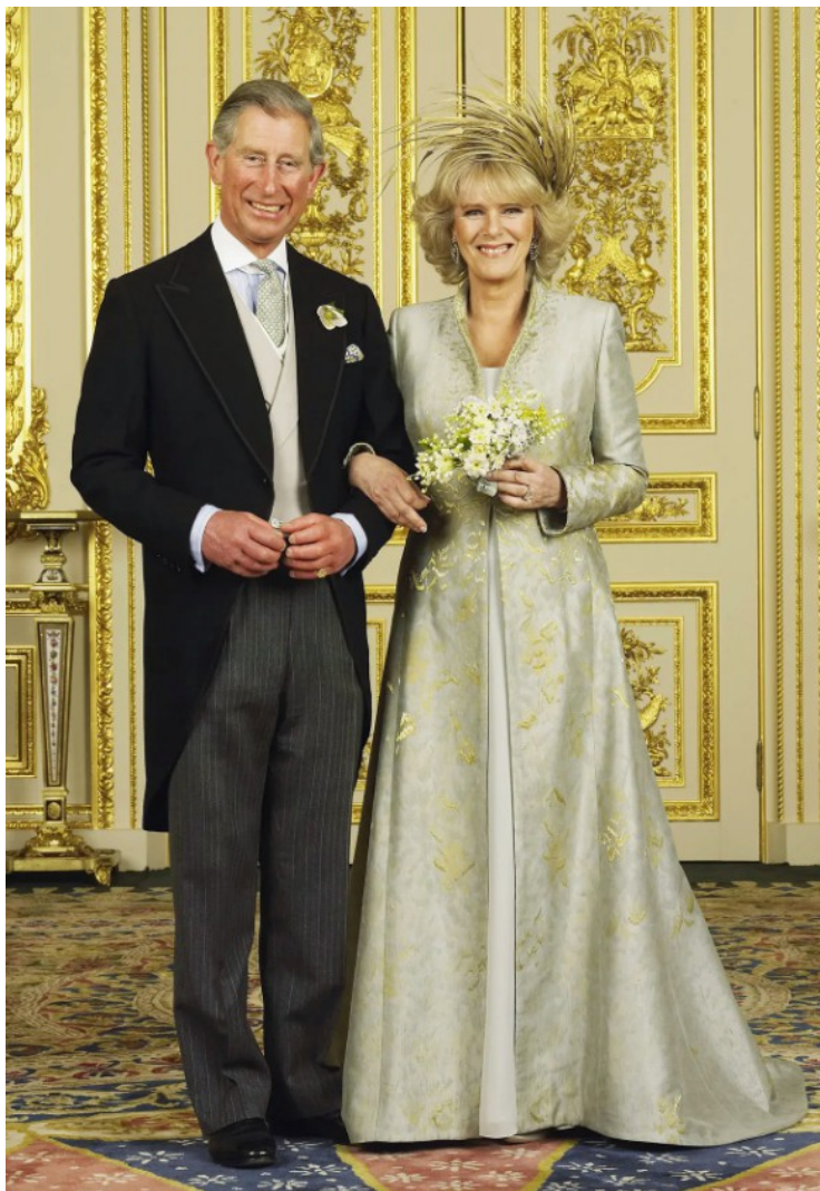
Wedding Camilla and Charles, 2005