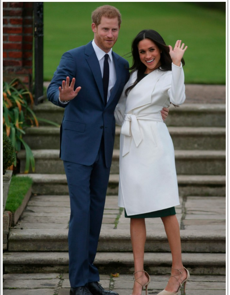
Prince Harry and Meghan Markle engagement picture, 2017