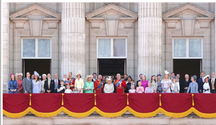
Trooping the colors, balcony picture, 2019