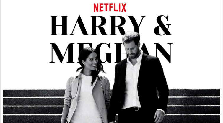
Netflix Documentary, Harry and Meghan, 2022