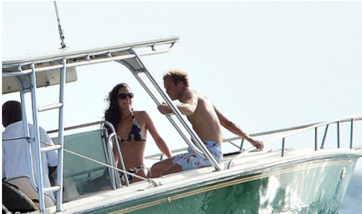
Mustic Holidays, Kate and William 2019