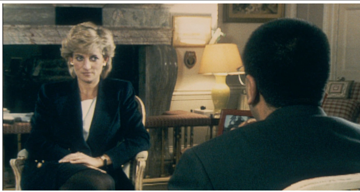
Diana Infamous BBC interview, 1995