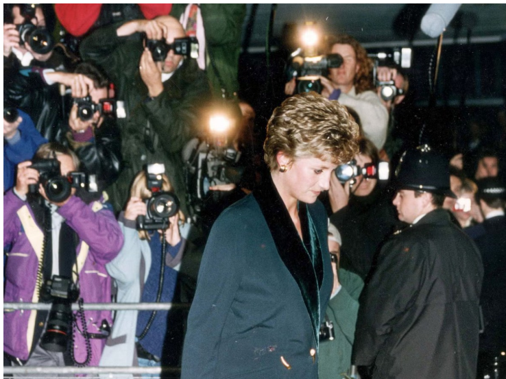
Princess Diana, 1991