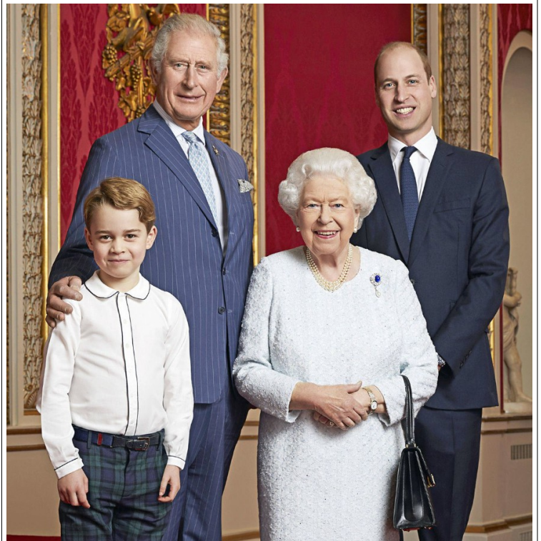
Christmas Card, 2019