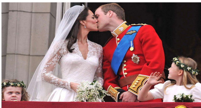
William and Kate wedding Kiss, 2010