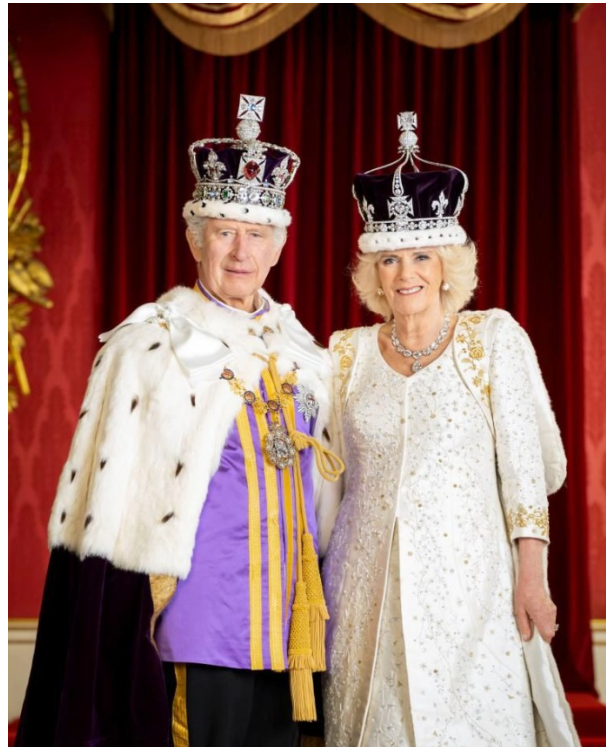
King Charles III and Queen Camilla, 2023