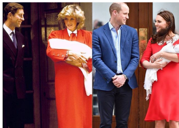
Presentation of Prince Harry (1980) and Prince Louis (2018)