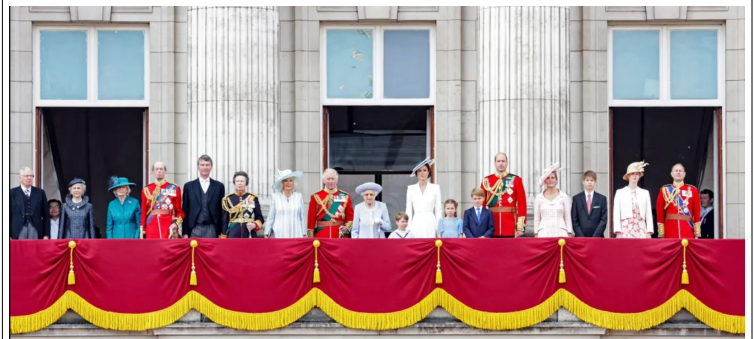
Trooping the Colors, 1 st day of the Jubilee, 2022