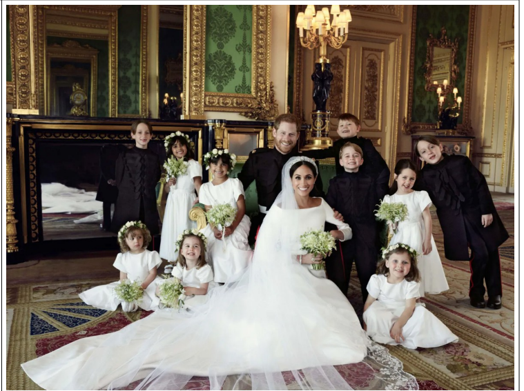
Wedding portrait, Harry and Meghan, 2018