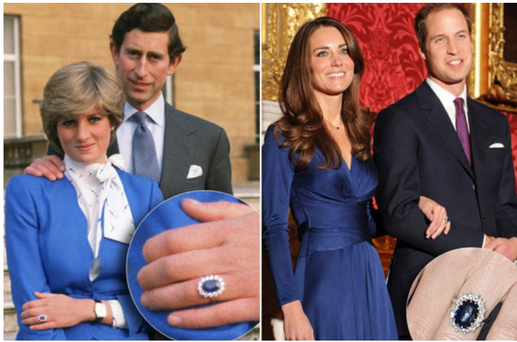
Diana and Kate's engagement pictures (1981 and 2010)