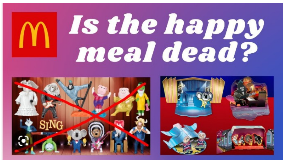
Mac Donald's to ban all plastic toys from the happy Meal menu, dec 2021

CORRECTION DST – How Burger makes History (mac do happy meal)