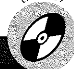
A 2007 NPR radio programme.