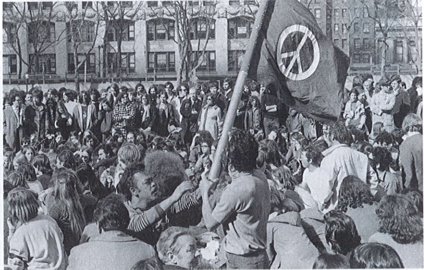
Anti-Vietnam War protest

The Vietnam War begins (ends in 1973 with the treaty of Paris: American troops withdraw from Vietnam. 58,000 U. S. dead).