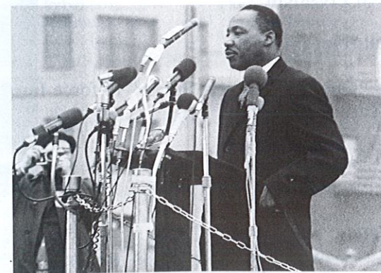
Martin Luther King, Jr. (1929-1968)

November 22: President John F. Kennedy is assassinated in Dallas (Texas).