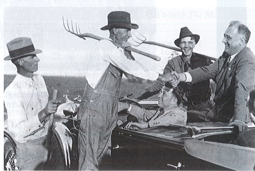
Franklin D. Roosevelt 1932

President Roosevelt launches his “New Deal” to fight unemployment and the economic crisis.