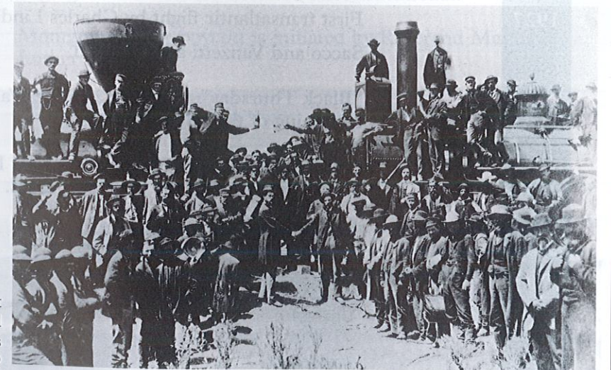
Joining East and West railroads 1869

Completion of the first transcontinental railroad.