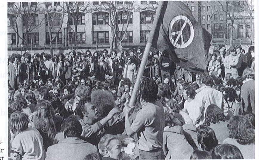
Anti-Vietnam War protest

The Vietnam War begins (ends in 1973 with the treaty of Paris: American troops withdraw from Vietnam. 58,000 U. S. dead).