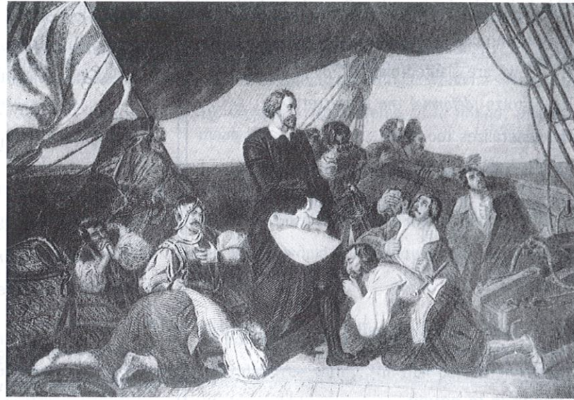
Christopher Columbus sighting America 1492

Christopher Columbus discovers America (Cuba and Hispaniola – today, Haiti and the Dominican Republic) by mistake.