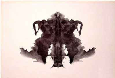
Plate IV is the "father card." At first glance it is a difficult blot to see as a single image. The two lower corners are often described as shoes or boots. This card may also be seen as viewing a person from below or a male figure with an enormous sex organ.

The "boots" are fairly conspicuous; between them is the apparent head of a dog or Chinese dragon. Many subjects see the blot as an animal skin. After a few seconds, though, most can see it as a standing figure seen from below.