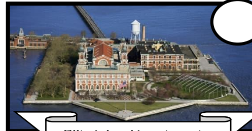
Ellis Island Immigration museum