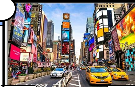
Times Square / Broadway