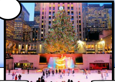
The Rockefeller Center