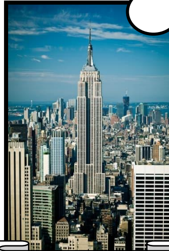
The Empire State Building

9 It links the boroughs of Manhattan to Brooklyn and it is one of the oldest suspension bridges in America.