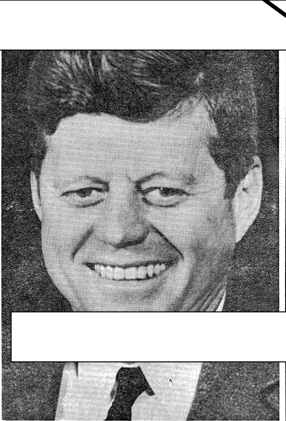
TURN TO PAGE 3

The White House staff said Mrs Kennedy would return to Washington late today to be with her children, Caroline, aged 6, and John Jr., who will be 3 next week.