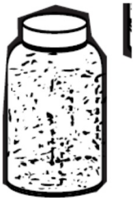
Peanut butter $1.50