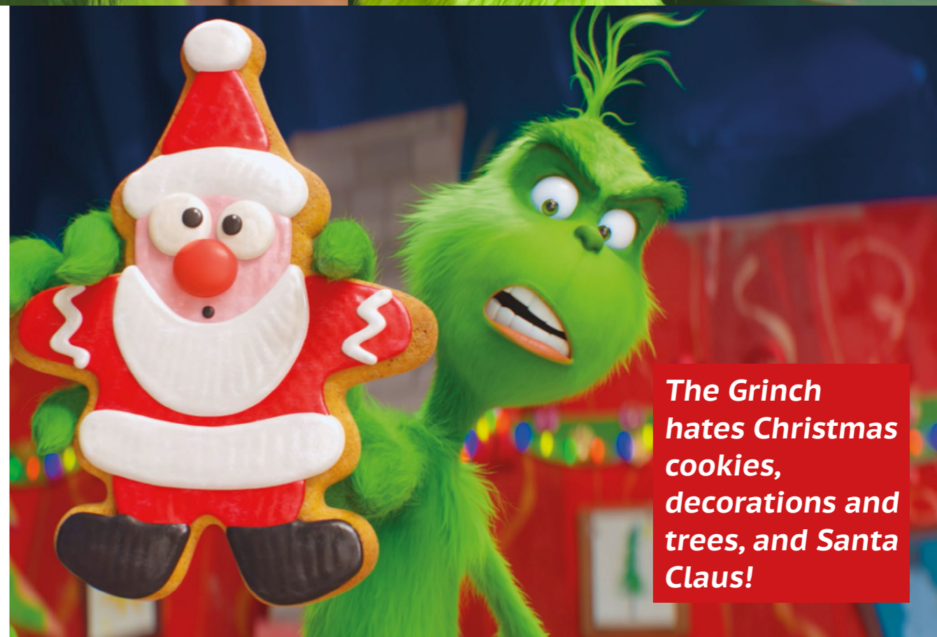
The Grinch hates Christmas cookies, decorations and trees, and Santa Claus!

stocking (n) here, a big sock children leave for presents from Santa