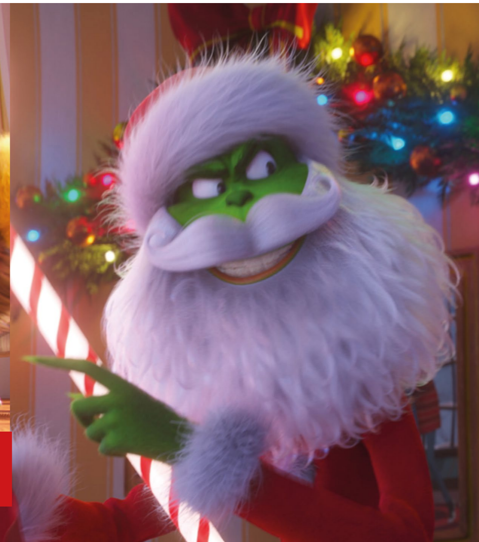
The Grinch disguises himself in a Santa costume to ruin Christmas.

“Every Who down in Who-ville liked Christmas a lot, But the Grinch, who lived just north of Who-ville, did NOT!”