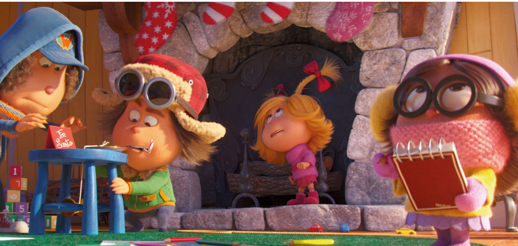
Cindy-Lou (centre) and her friends hang their stockings on the fireplace for Santa. They write Santa a Christmas card.

He is very surprised on Christmas morning. Can you guess what the people of Who-ville decide to do?